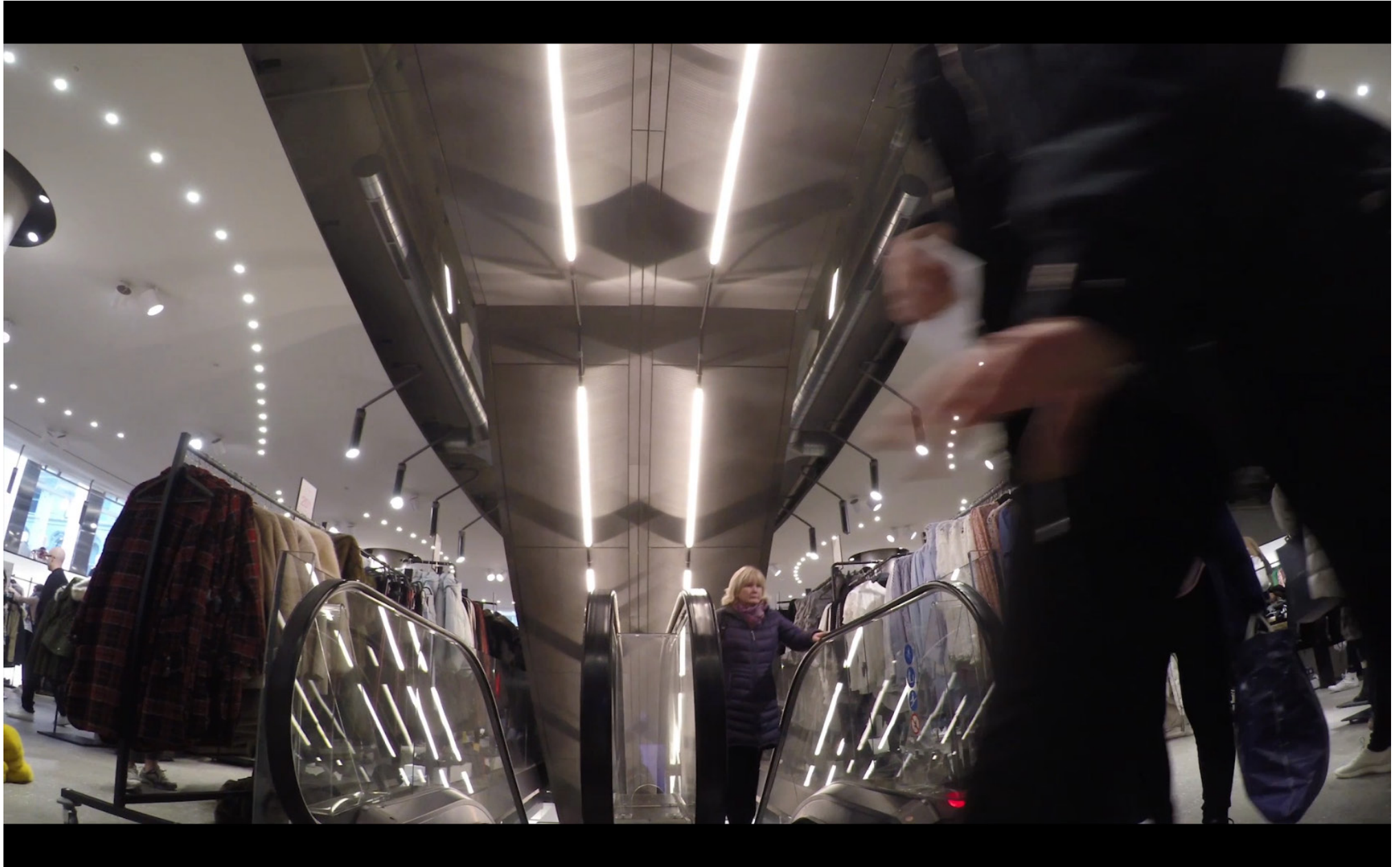
'To tame a pack of Dogs, Zara', stereoscopic HD film with sound (still), 2017, ANDOR, London [Collaboration with Kate Mackeson]