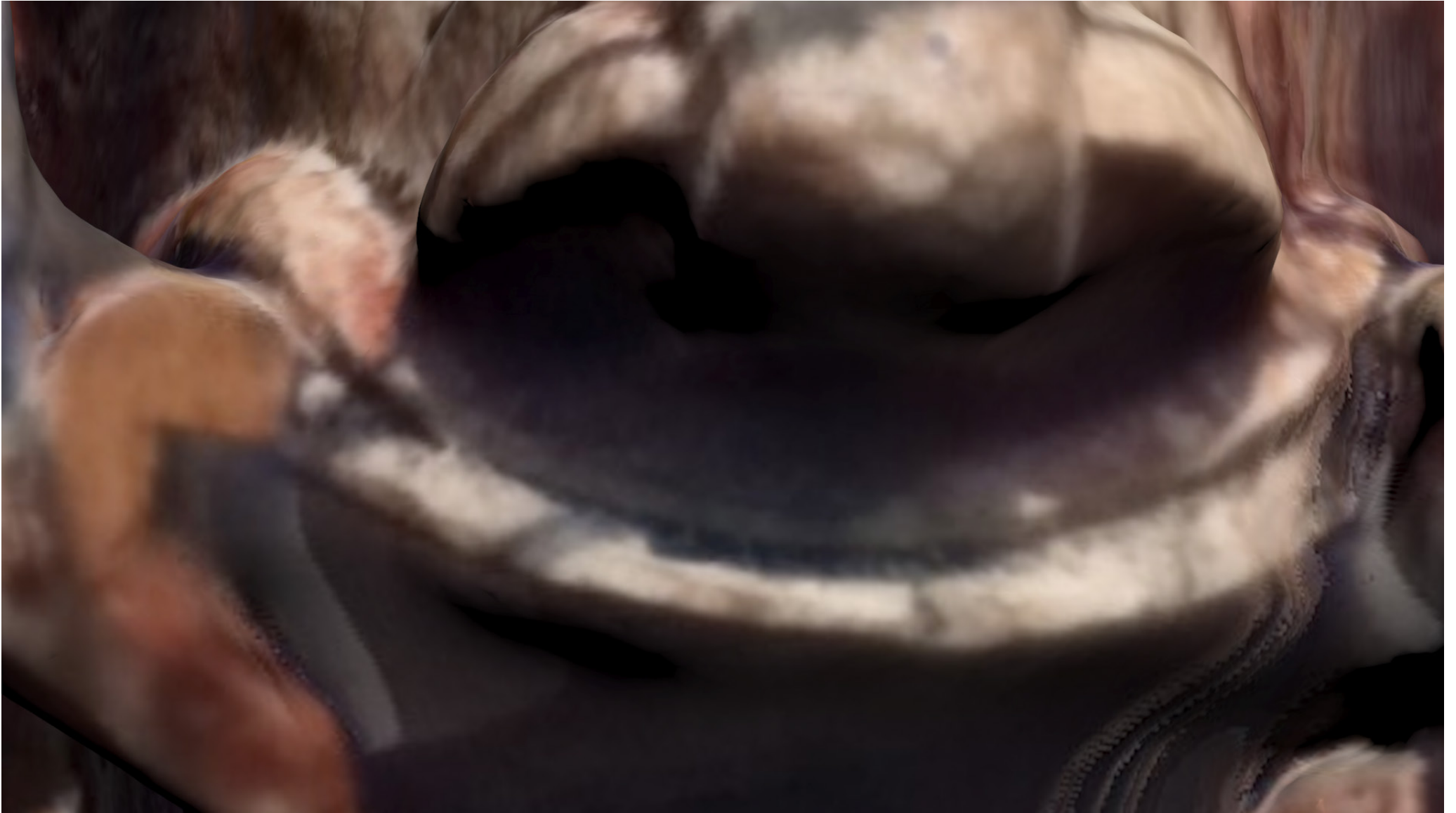
'The little immaculate conception', Miracle Marathon, Serpentine Galleries, video animation + sound (still), 2016