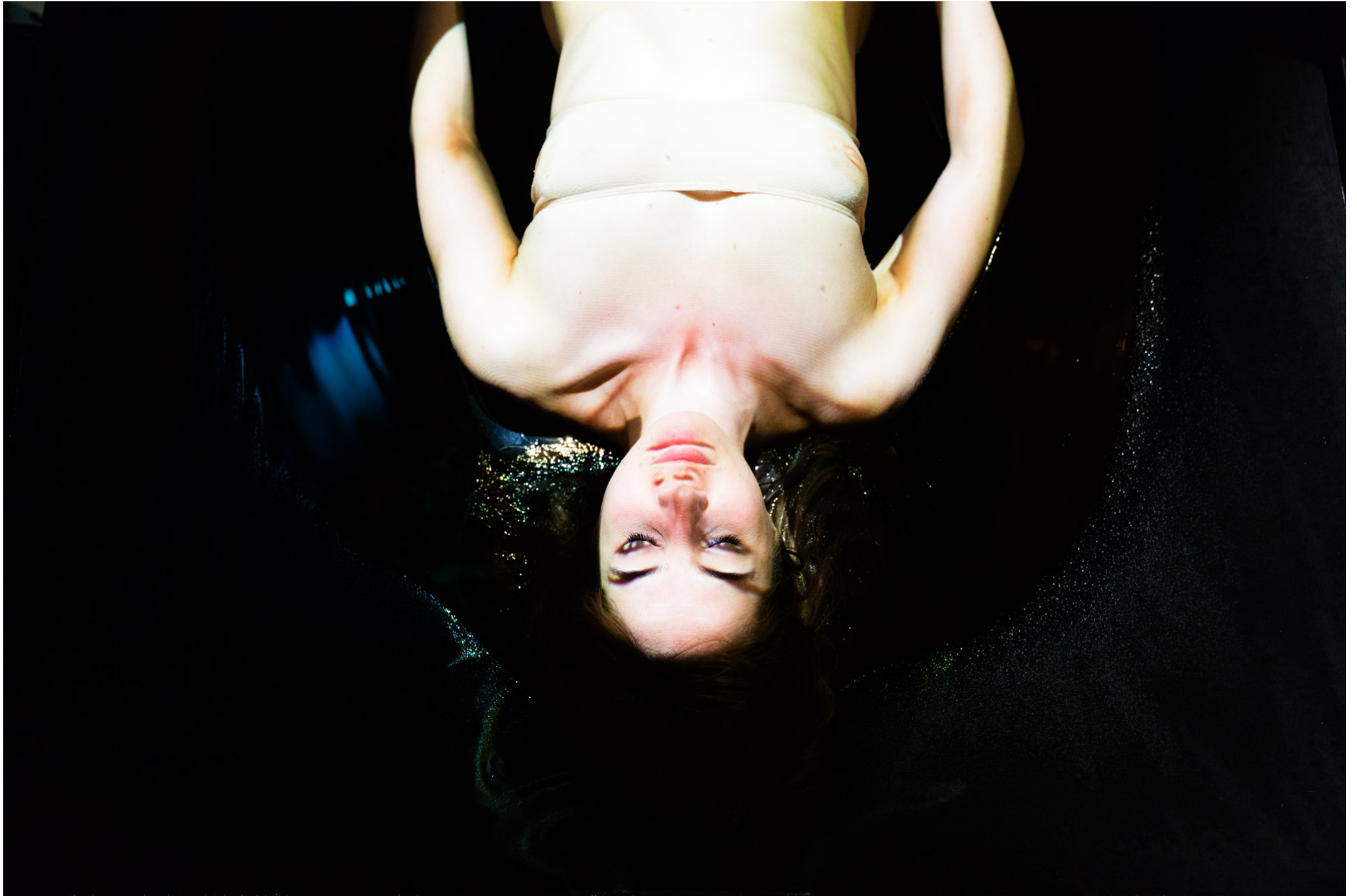
'Thelma and Louise', Serpentine Galleries, Park Nights, Installation, performance, film, 2015