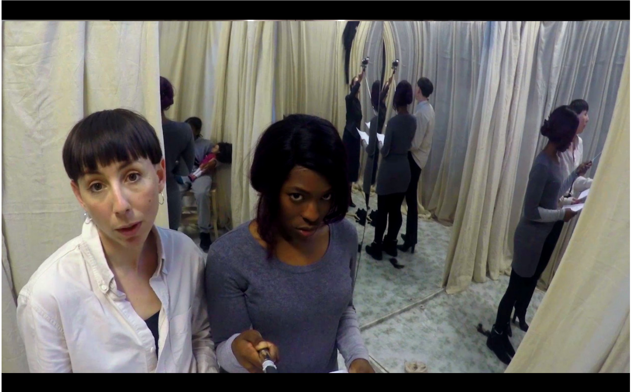
'To tame a pack of Dogs, Zara', stereoscopic HD film with sound (still), 2017, ANDOR, London [Collaboration with Kate Mackeson]