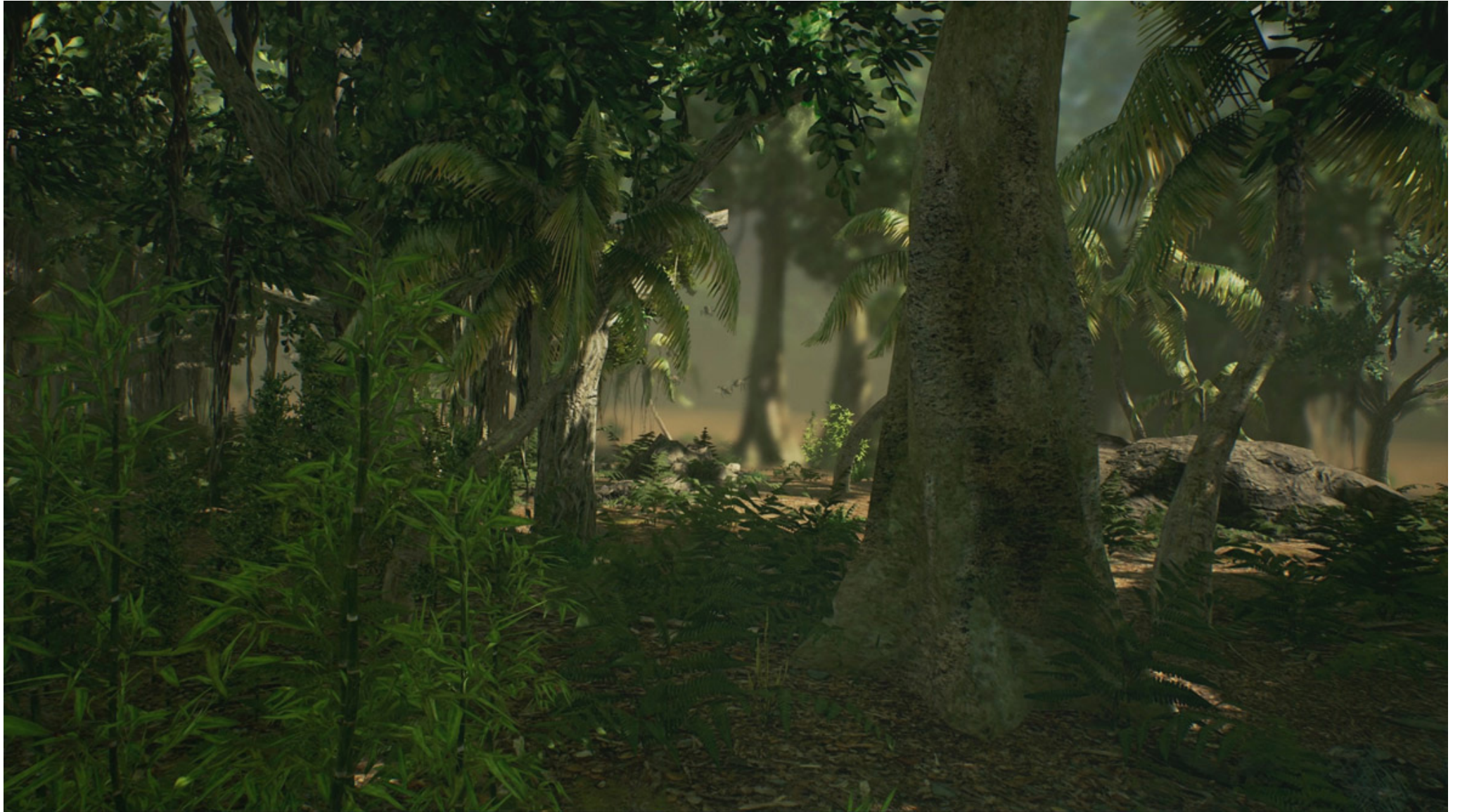
'The little immaculate conception', Miracle Marathon, Serpentine Galleries, video animation + sound (still), 2016