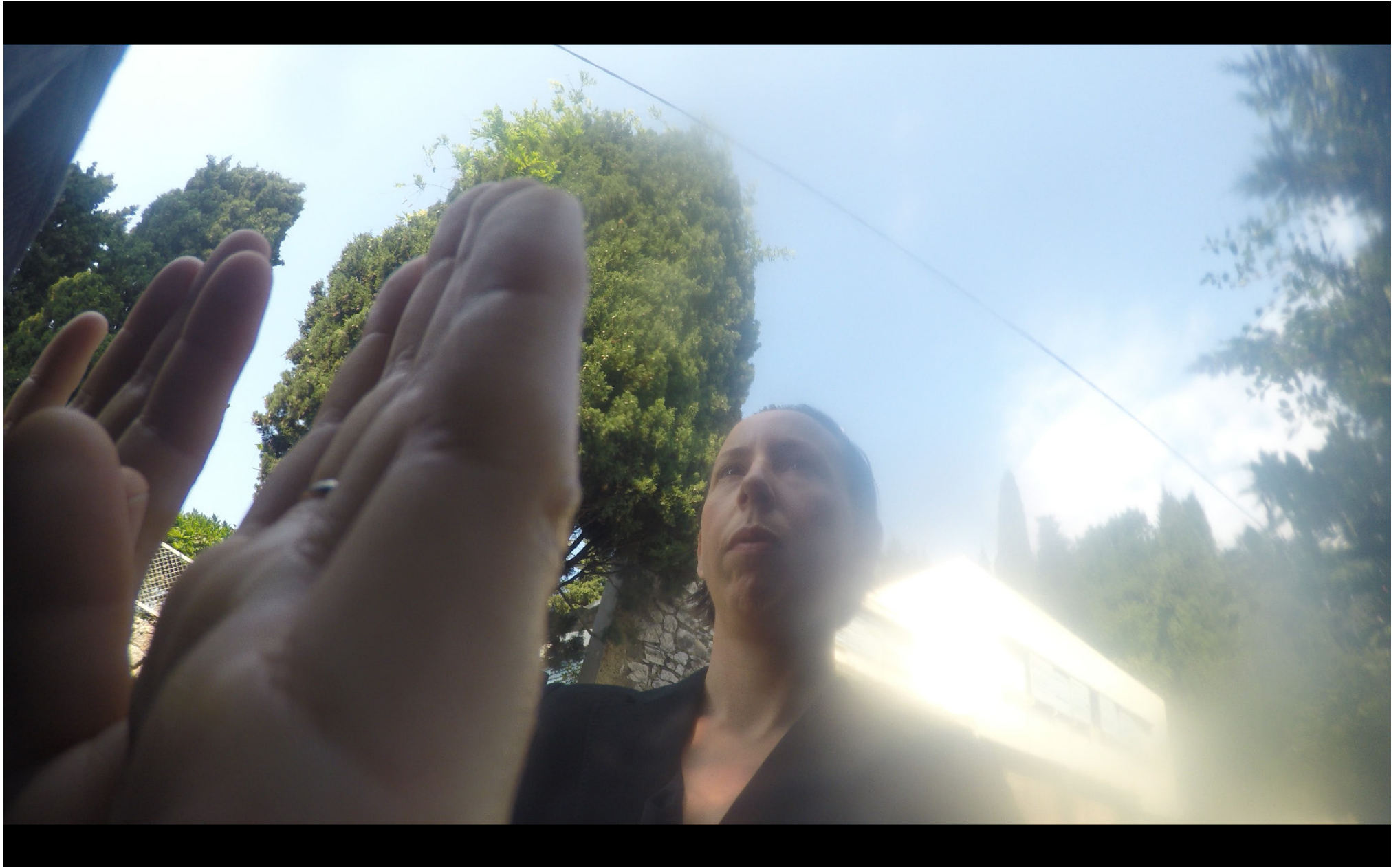
'To tame a pack of Dogs, Eileen', HD video with sound (still), 2017, In Extenso, Clermont Ferrand [Collaboration with Kate Mackeson]