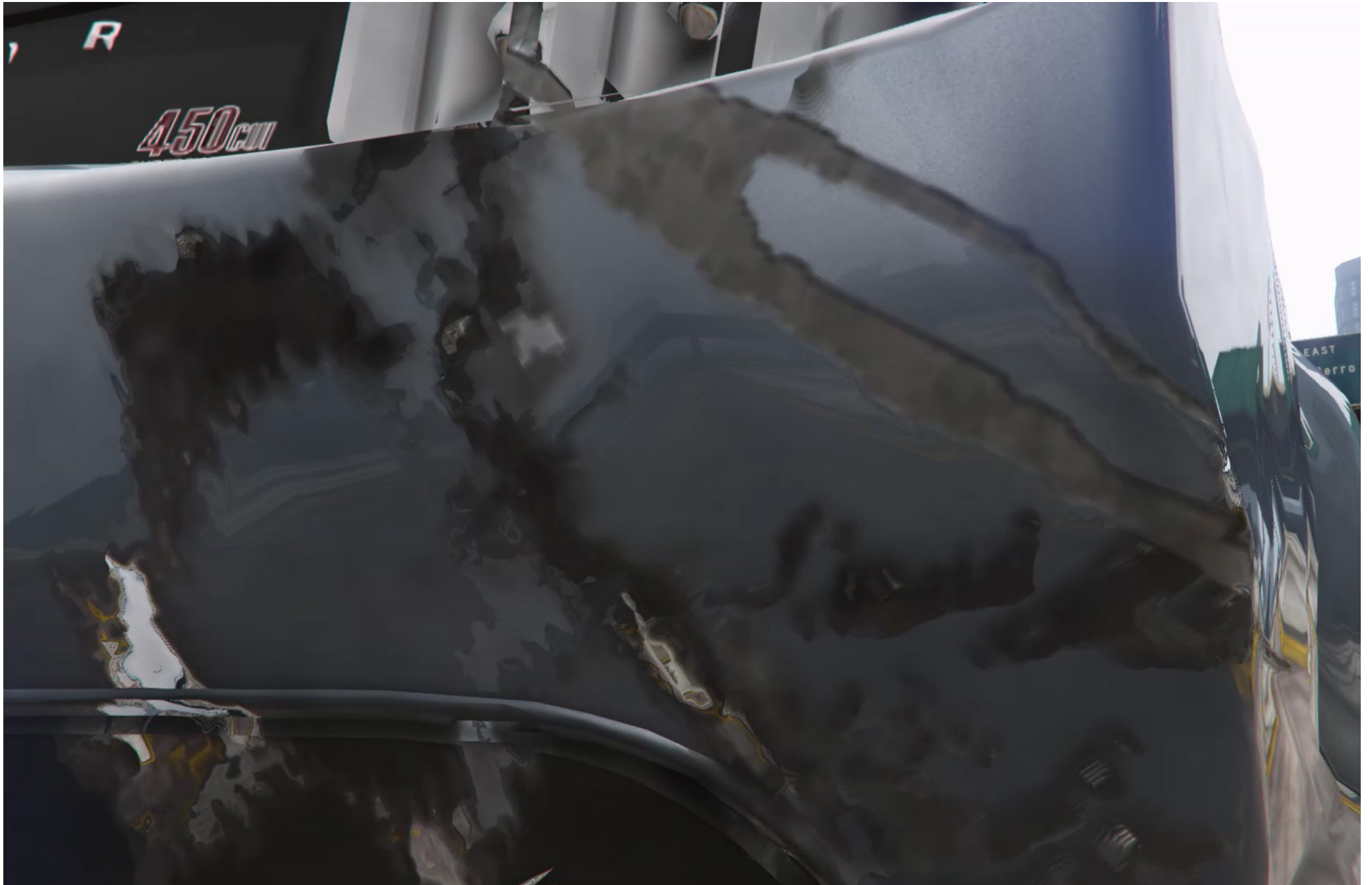
'The little immaculate conception, OBLIVION', video animation + sound (still), 2017